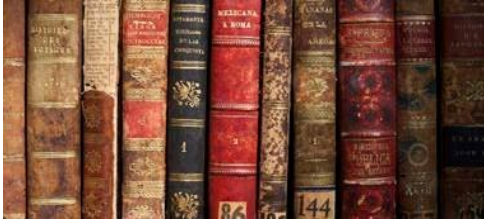
Bound-book scanning and Large Format (textbooks; magazines; notebooks; newspapers and more)